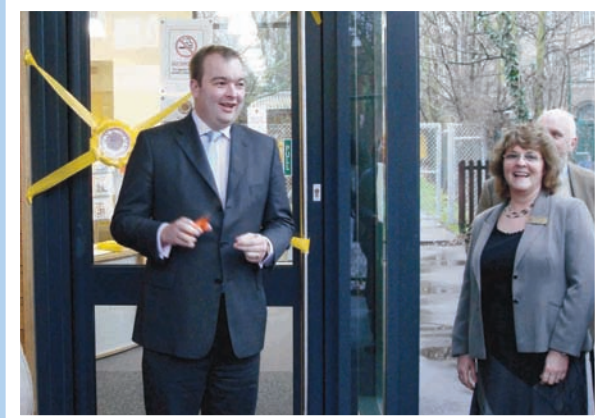
Opening the new Summerville Children's Centre in Westcliff