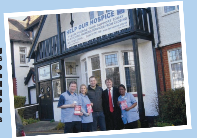
Supporting Havens Hospice along with staff and Southend West MP David Amess