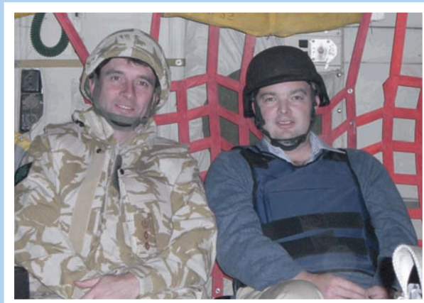
A helicopter ride in Afghanistan during a visit to learn more about the UK's programme on the ground