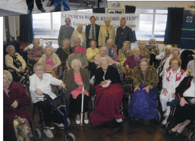
Locals who've reached their 100th birthdays join David Amess (back, centre) to clinch the world record for largest centenarians' gathering

Promoted on their own behalfs by James Duddridge MP and David Amess MP, both of House of Commons, London SW1A 0AA and paid for from their respective Communications Allowances.