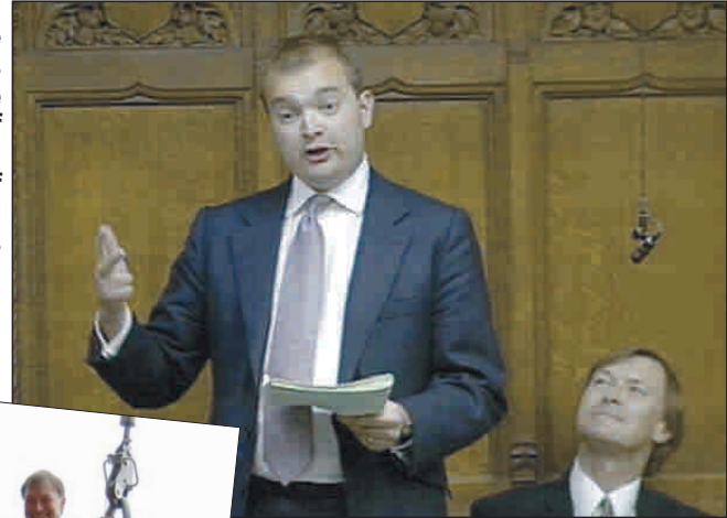
James Duddridge and David Amess debating in the House of Commons on behalf of Southend residents