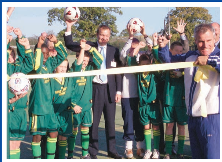
Opening the new pitch at King Edmund School